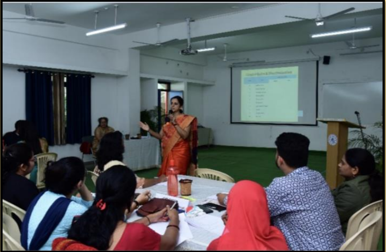
THE ERUDITE SPEAKERS COMMUNICATING ABOUT GENDER SENSITIVE SCHOOLS, WHICH PROMOTE GENDER SENSITIVITY IN CLASSROOM TRANSACTIONS AND EXTRACURRICULAR ACTIVITIES