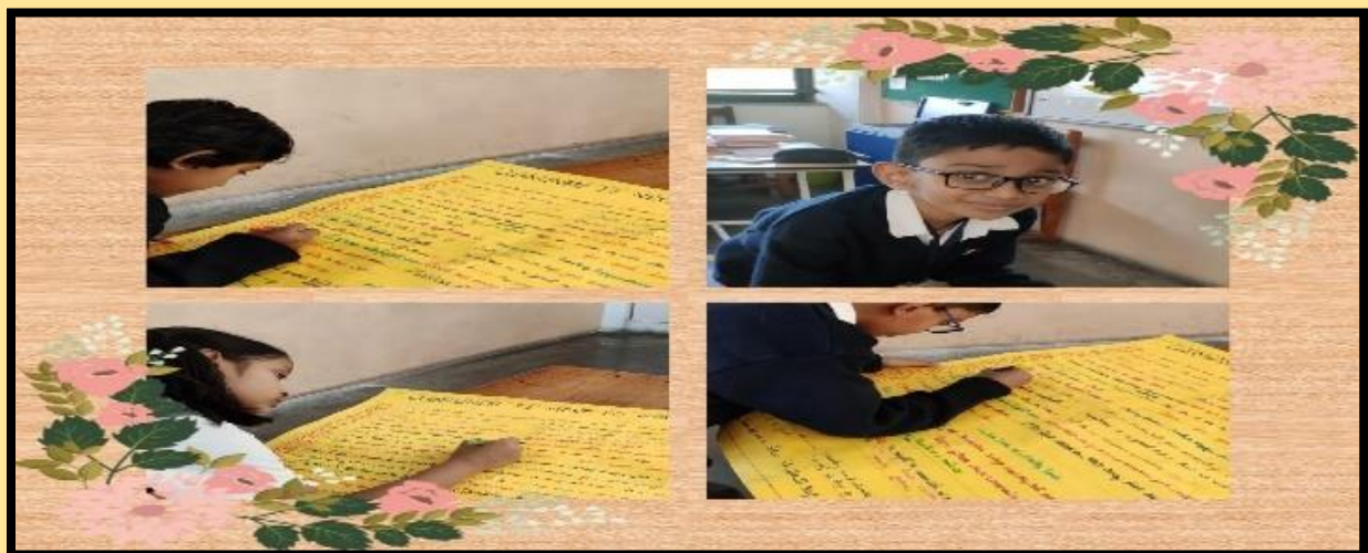
STUDENTS SIGNING THE CHART

❖ Signature Campaign – Under this activity students of Grades I to X signed and pledged to keep their surroundings clean.