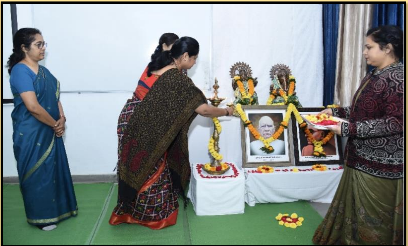
WORKSHOP WAS COMMENCED BY OFFERING A HUMBLE PRAYER AND LAMP LIGHTENING CEREMONY