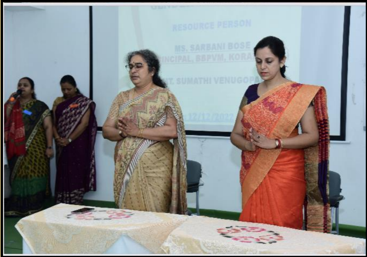
WORKSHOP WAS COMMENCED BY OFFERING A HUMBLE PRAYER AS A TRIBUTE TO GODDESS SARASWATI