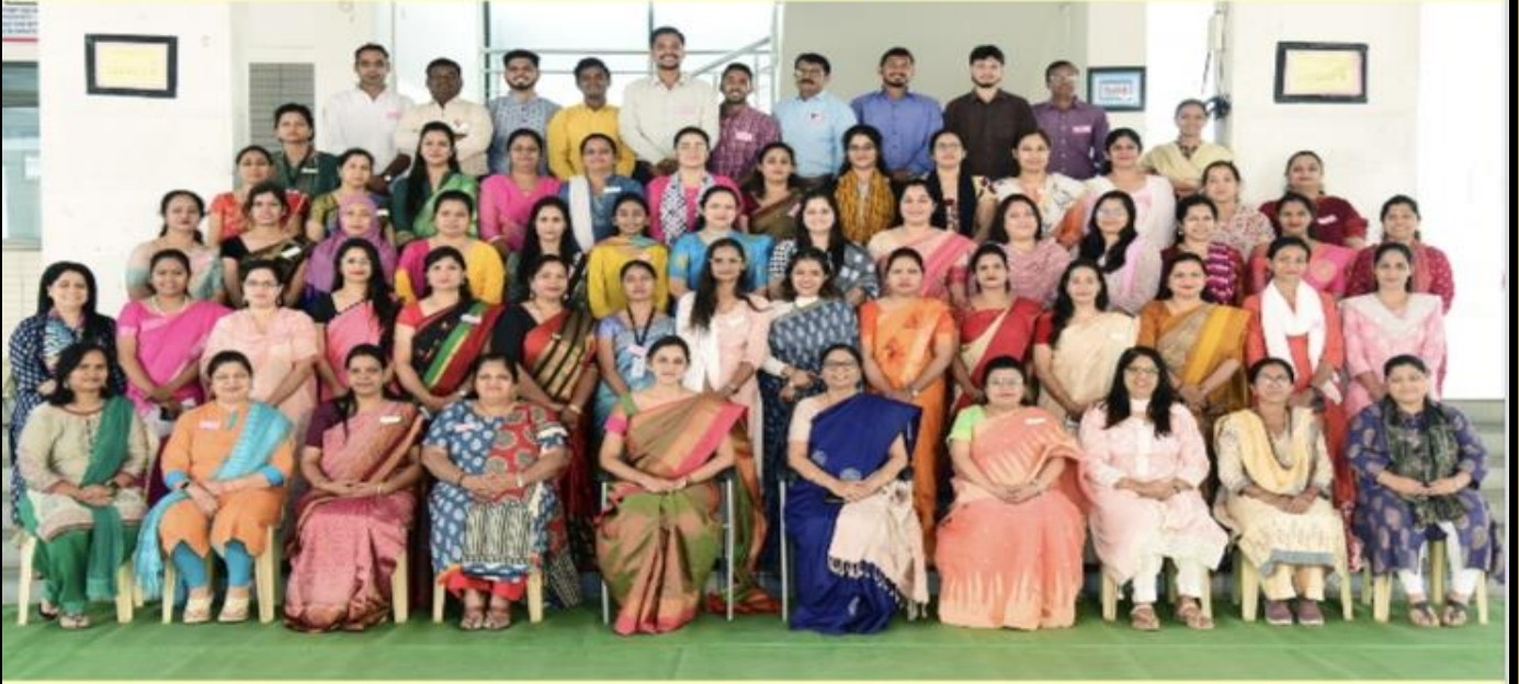
Workshop on "CLASSROOM MANAGEMENT" Conducted by Nagpur Sahodaya, Date.. 30th and 31st October 2022