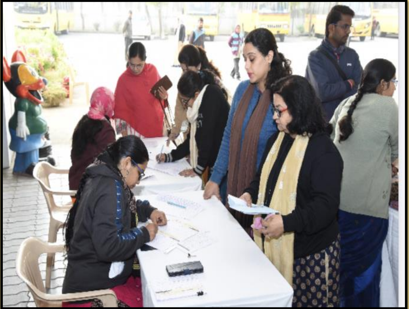
.PARTICIPANTS REGISTERING FOR THE WORKSHOP