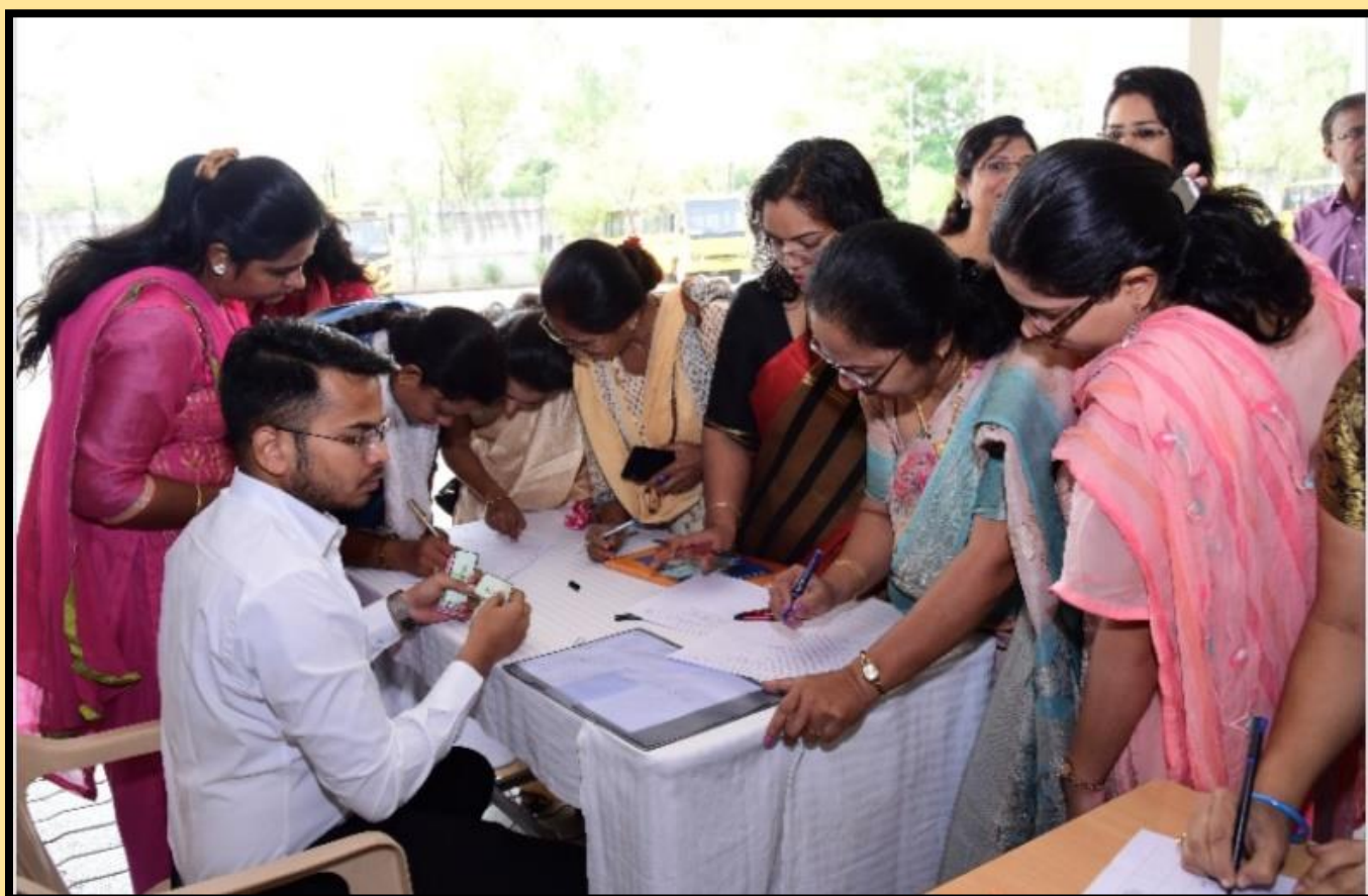
TEACHERS REGISTERING FOR THE WORKSHOP