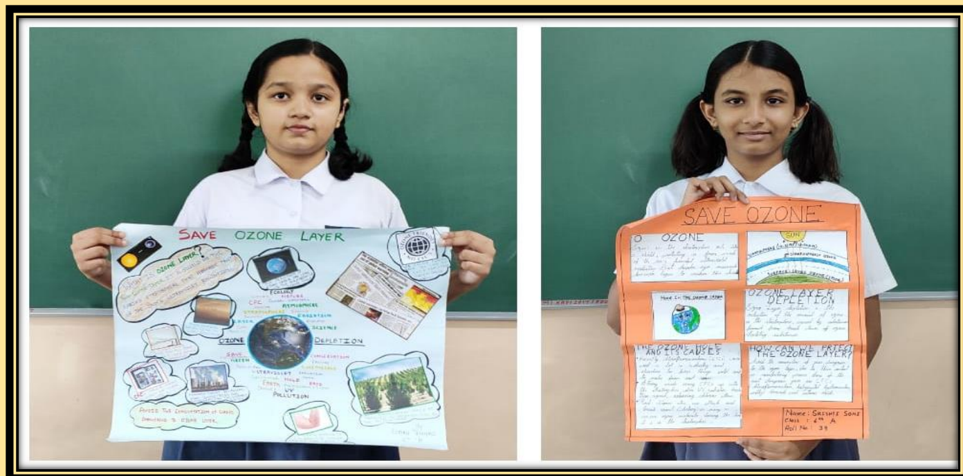
Girls ... showcasing their creativity.

The students of std VI to VIII took part in a collage making activity, highlighting the need of the ozone layer protection. The students effectively showcased their creativity to make everyone aware about the use of environment-friendly cleaning products, prohibit the use of nitrous oxide, buying air conditioning and refrigeration equipment that do not use HCFCs as refrigerant. They also advised to discourage the use of private vehicles and use public transport, carpool or bicycle through their collage.