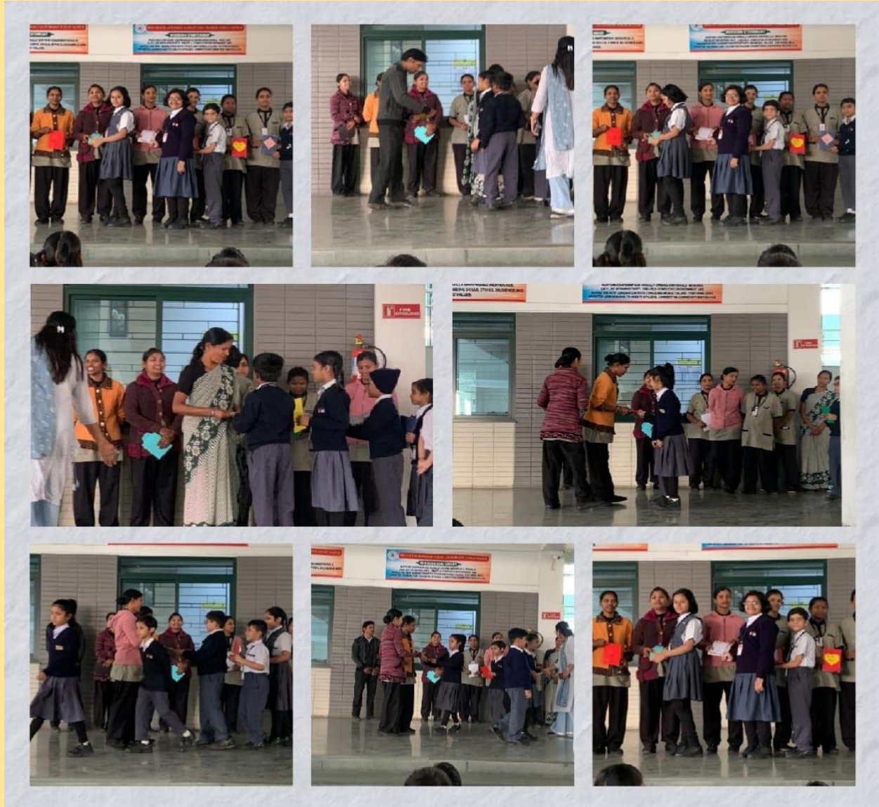
STUDENTS GIVING THANK YOU CARDS TO THE HELPERS

❖ Thank You Card Giving - Children from Grade III, IV, V & VI prepared Thank You Cards for the helpers in the school. They gave the cards in the assembly to show the gratitude towards their work.