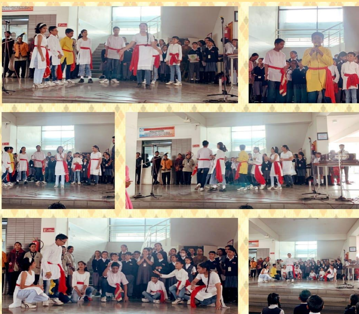
STUDENTS PRESENTING NUKKAD NATAK IN THE ASSEMBLY