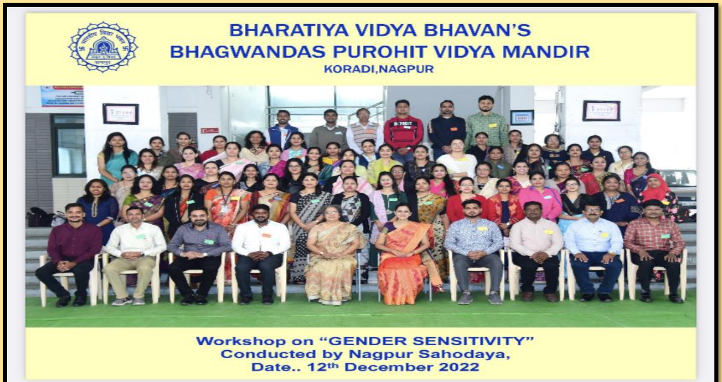
GROUP PHOTOGRAPH WITH ALL THE PARTICIPANTS